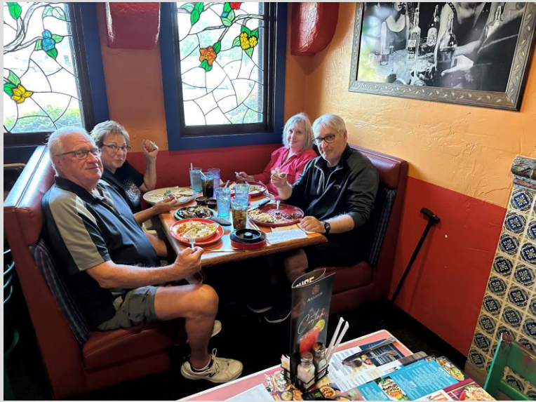
Jacket Night at Azteca!